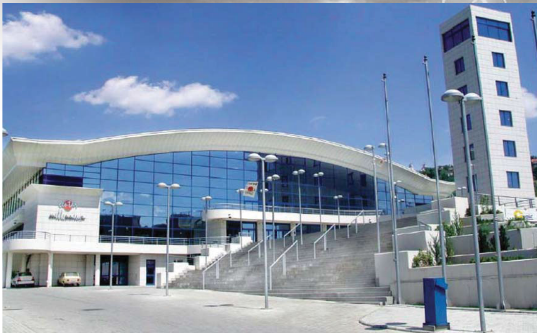
Centar Millennium A D