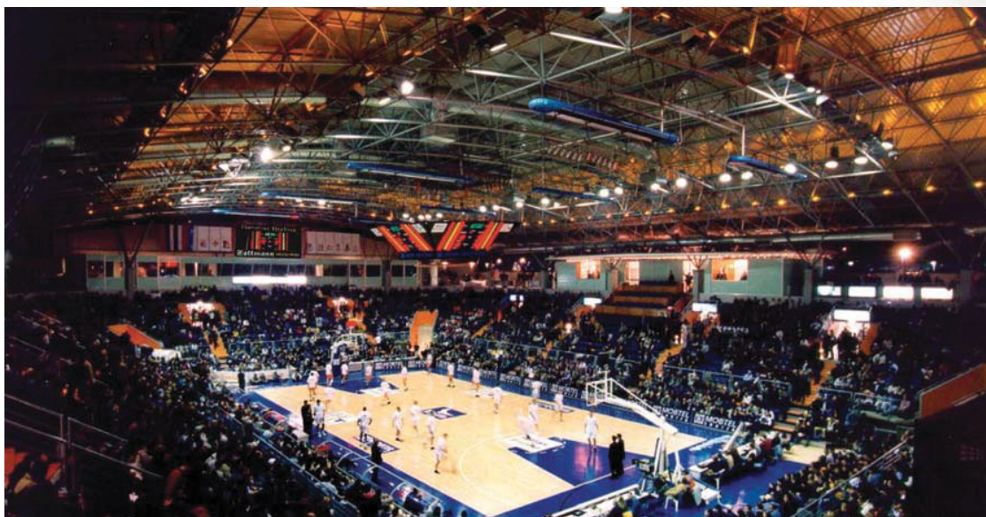
Great Hall Centar Millennium